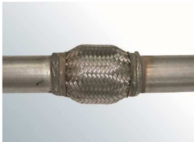
1. Remove affected part.

In practically all vehicles, flexible tubes form part of the front section of the exhaust system. They uncouple the system from engine movements and vibrations and are continuously subject to high loads. It therefore comes as no surprise that they are liable to crack and are often considered to be a weak point. It is therefore common practice to install new flexible tubes and this can often save the time and cost involved in replacing catalytic converters or diesel particulate filters that are still functioning perfectly. However, here too, it is necessary to remember a few points that are necessary to maintain the basic tuning of the exhaust system.