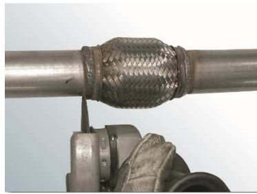
2. Cut off the old flexible tube with a flex at the marked position (behind the weld).