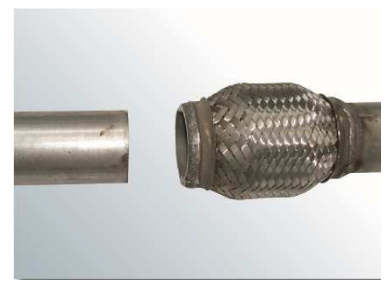
3. Remove old flexible tube.